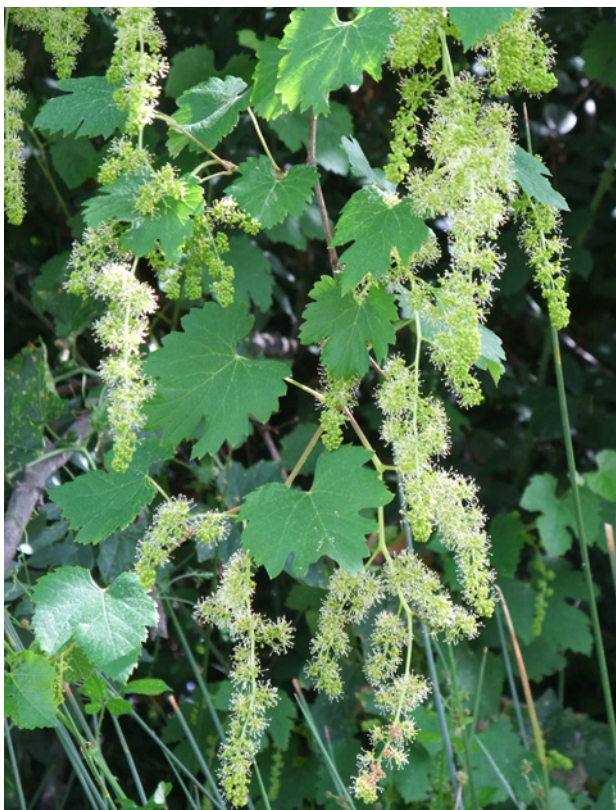
| Fig. 5: Male vine at flowering time (June).

Male individuals show a higher number of inflorescences per shoot (Fig. 5), with flowers that generally present fully developed stamens and no gynoecium (flower Type 1, according to OIV 2009). On the other hand, female flowers show reflexed