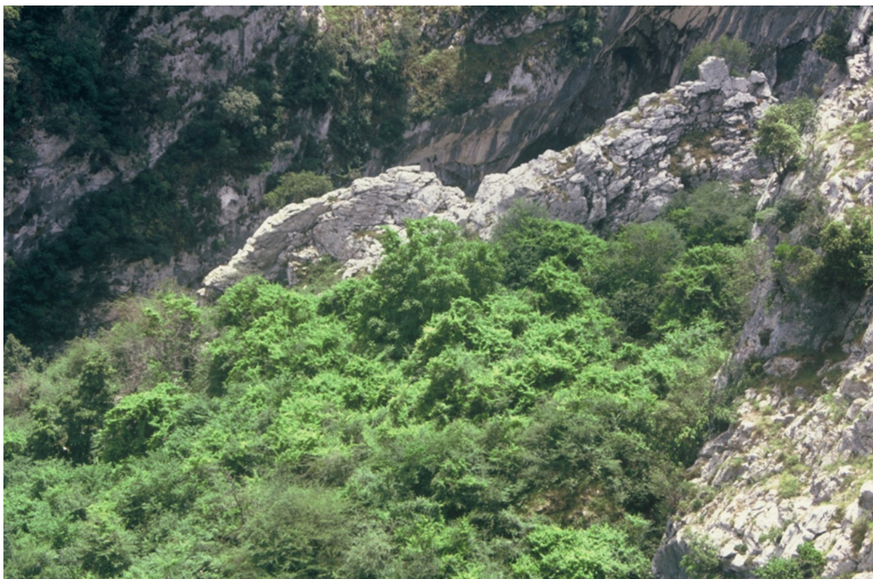
Fig. 3: Wild grapevines using mainly Prunus spinosa bushes as supporters in a colluvial position (Cares valley).