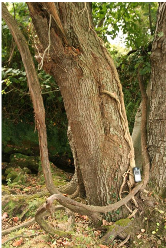
Fig. 2: Exemplar of wild grapevine climbing on its botanical supporter in the Deva river bank forest.

also in very residual places conserving small rests of natural vegetation within urban areas, the main supporters are: Ficus carica , Fraxinus excelsior , Laurus nobilis , Prunus spinosa , Rosa canina , Rosa sempervirens , Rubus ulmifolius , Salix alba , Sambucus nigra and Ulex europaeus .