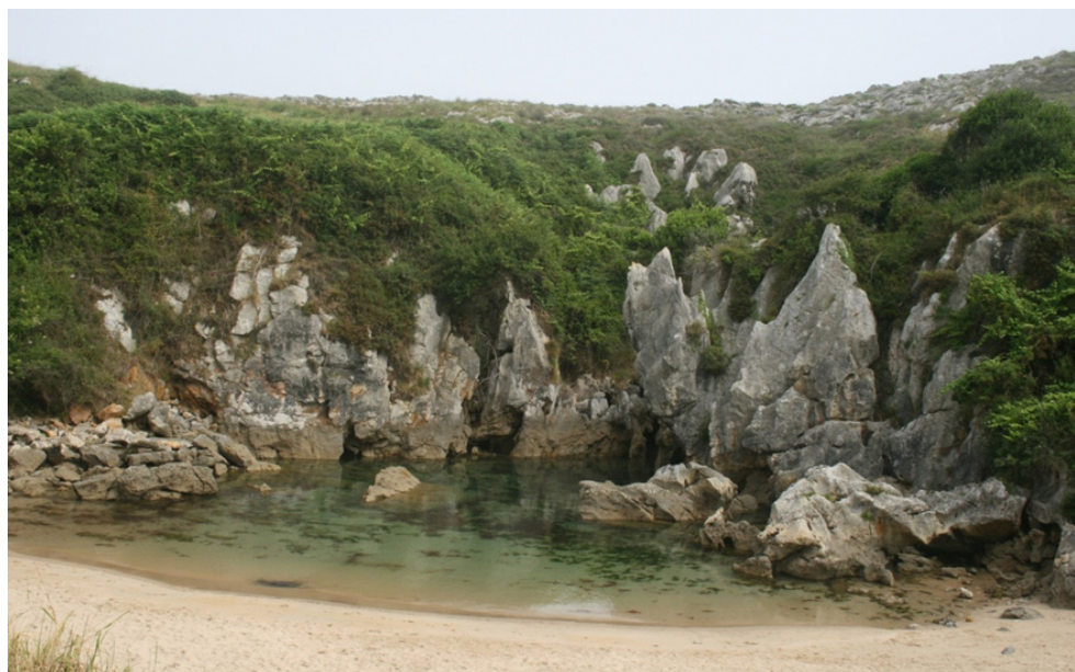
Fig. 4: The karstic landscape of Gulpiyuri beach, where the grapevines grow on the calcareous wall above the high tide level.

About the traditional uses of wild grapevine in Asturias, the only testimony found was the construction of hoops of fishing traps for lobster around Toranda beach.